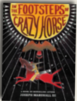
Cover art by Jim Yellowhawk