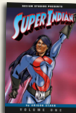
Super Indian Volume One: © 2012 Wacky Productions Unlimited. All Rights Reserved.